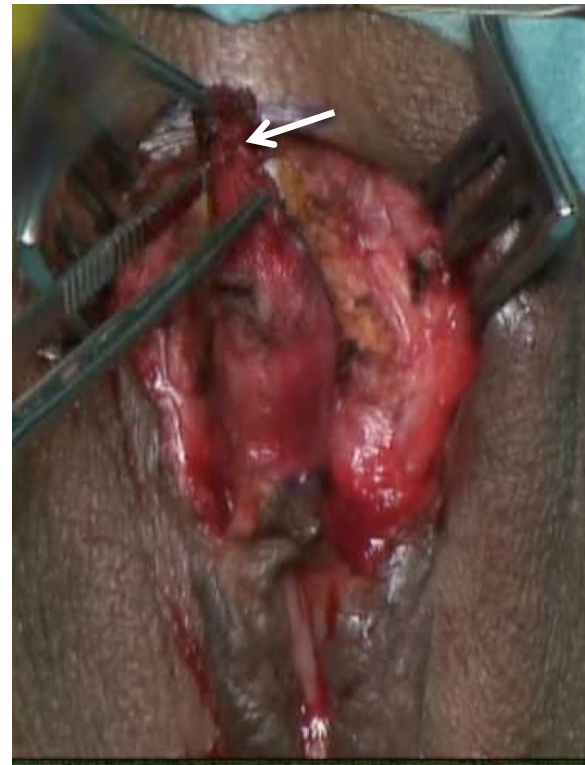
Fig. 2 Clitoral reconstruction in FGM/C type II. A post-traumatic neuroma of the clitoris was found within the peri-clitoral fibrotic tissue (arrow) removed around the clitoral stump

associated with FGM/C scarring. All women who underwent clitoral reconstruction at our clinic presented with at least a neuroma of the clitoris in the peri-clitoral scar tissue that was removed during surgery, although the neuroma was not always associated with pain or sexual symptoms. Four out of seven women experienced neuropathic clitoral pain.