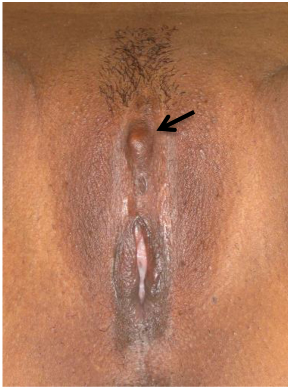
Fig. 1 FGM/C type II–III with cutting of the clitoris complicated by a painful clitoral neuroma (arrow).