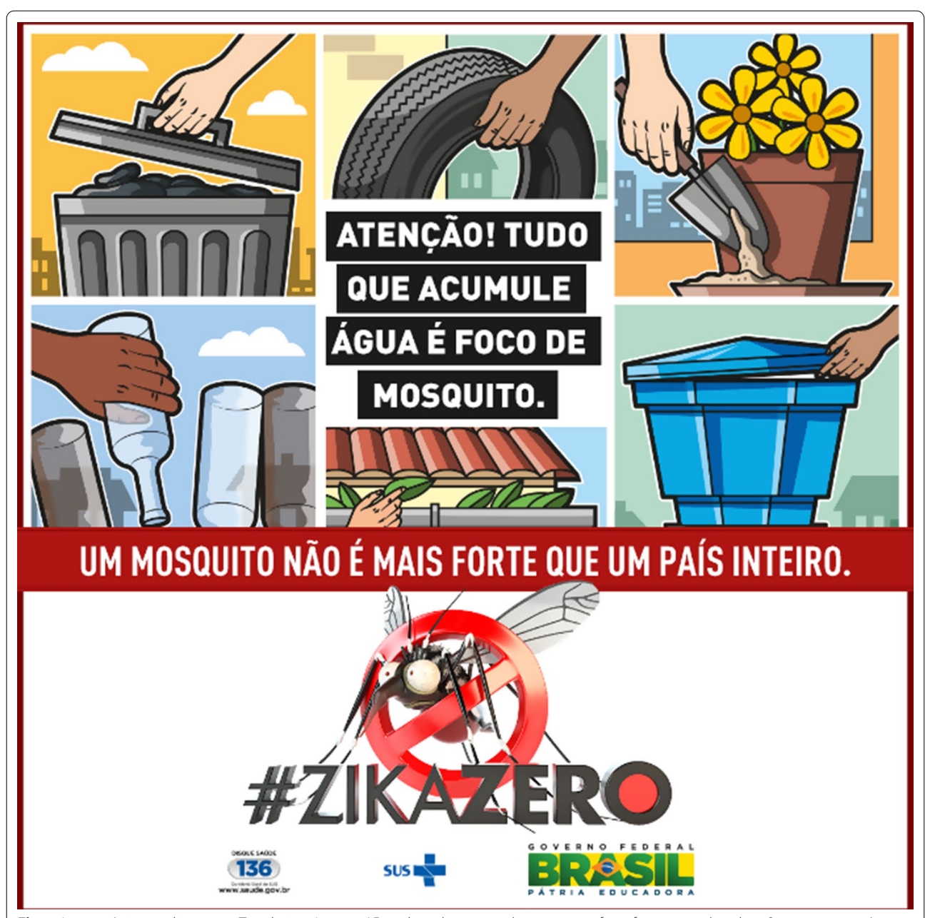
Fig. 1 Internet/print media pop up. Translation: Attention! Everything that accumulates water is a focus for mosquito breeding. One mosquito isn't stronger than a whole country

Coutinho et al. Reprod Health (2021) 18:40 Page 7 of 21