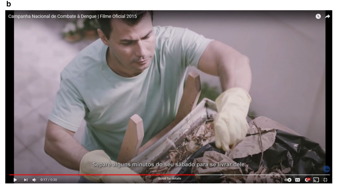
Fig. 5 a Woman places sand inside the flower vases; b A man uses a ladder to reach the roof and clean the gutters

( Gestante ) neglected women who are not pregnant. The challenges of implementing safe sex, discussed in the next sections, also remained unaddressed.