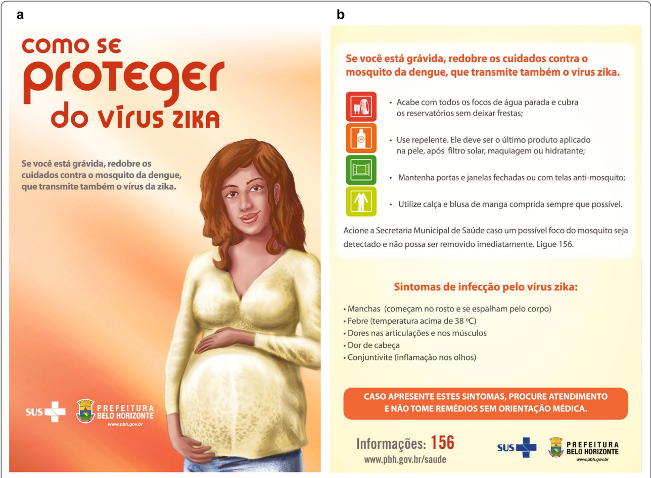
Fig. 4 a Front side of the folder prepared by the Municipal Government in Belo Horizonte; b Backside of the folder prepared by the Municipal Government in Belo Horizonte

Coutinho et al. Reprod Health (2021) 18:40 Page 12 of 21