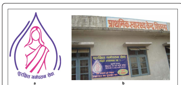
Figure 2 Nepali Safe Abortion Logo, a) Original graphic and b) Applied in the field.

Since integration of safe abortion service monitoring into the national HMIS system in 2009, four main indicators have been followed: number of women served, percentage of women receiving postabortion care, percentage of cases with complications, and percentage of women receiving postabortion contraception. The number of women served has increased by year, for totals of 83,978, 88,938 and 95,305 in 2009, 2010 and 2011,